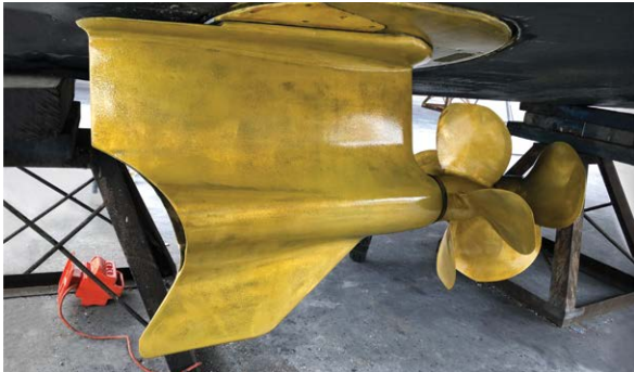
PropOne™ applied to a Volvo IPS™ unit